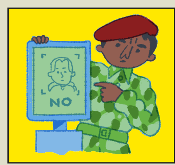
If no message appears and security personnel instruct face scanning, inquire about the message or a consent form and insist on selecting