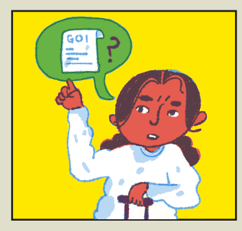
If security personnel persists, ask to see the government order supporting their claims.