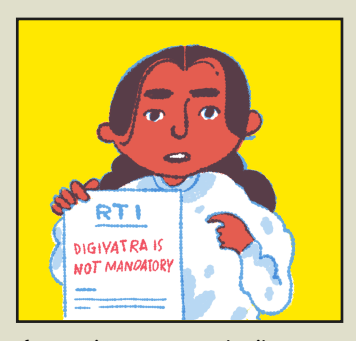
If security personnel stil persists, present a copy of this RTI response from the Ministry of Civil Aviation (scan the QR code below) explicitly stating that "DigiYatra is not mandatory."