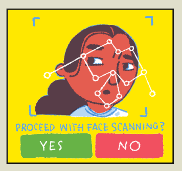
Check the screen next to the security personnel. If it prompts "Proceed with face scanning?", select 'No'.