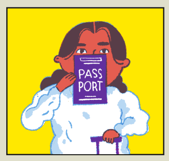
Opt for IDs like PAN, Voter Card, Driver's license, or Passport instead of Aadhaar. If using Aadhaar, closely guard it and decline any recording or scanning.